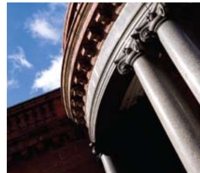
The Whitworth Art Gallery

'Close Up' featuring Jonathan Franzen, Sunday 3 Oct, 7pm-9pm. The Whitworth Art Gallery, Oxford Road M15 6ER. £8.