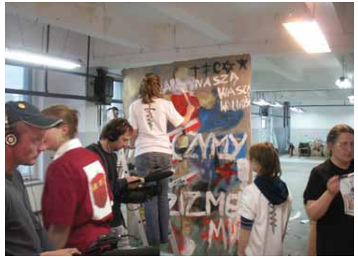
Top row: Repetition (2007), Artur Żmijewski, courtesy of Foksal Gallery Foundation; Bottom row: Them (2007), Artur Żmijewski, courtesy of Foksal Gallery Foundation

Artur Żmijewski Cornerhouse 70 Oxford Street M1 5NH Telephone 0161 200 1500 www.cornerhouse.org