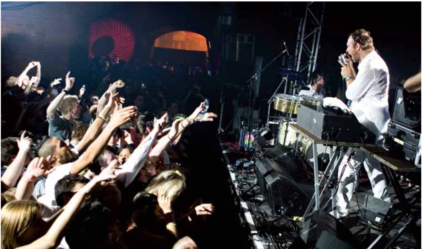
The Warehouse Project

Manchester Literature Festival Telephone 0161 236 5555 www.manchesterliteraturefestival.co.uk 15-25 Oct