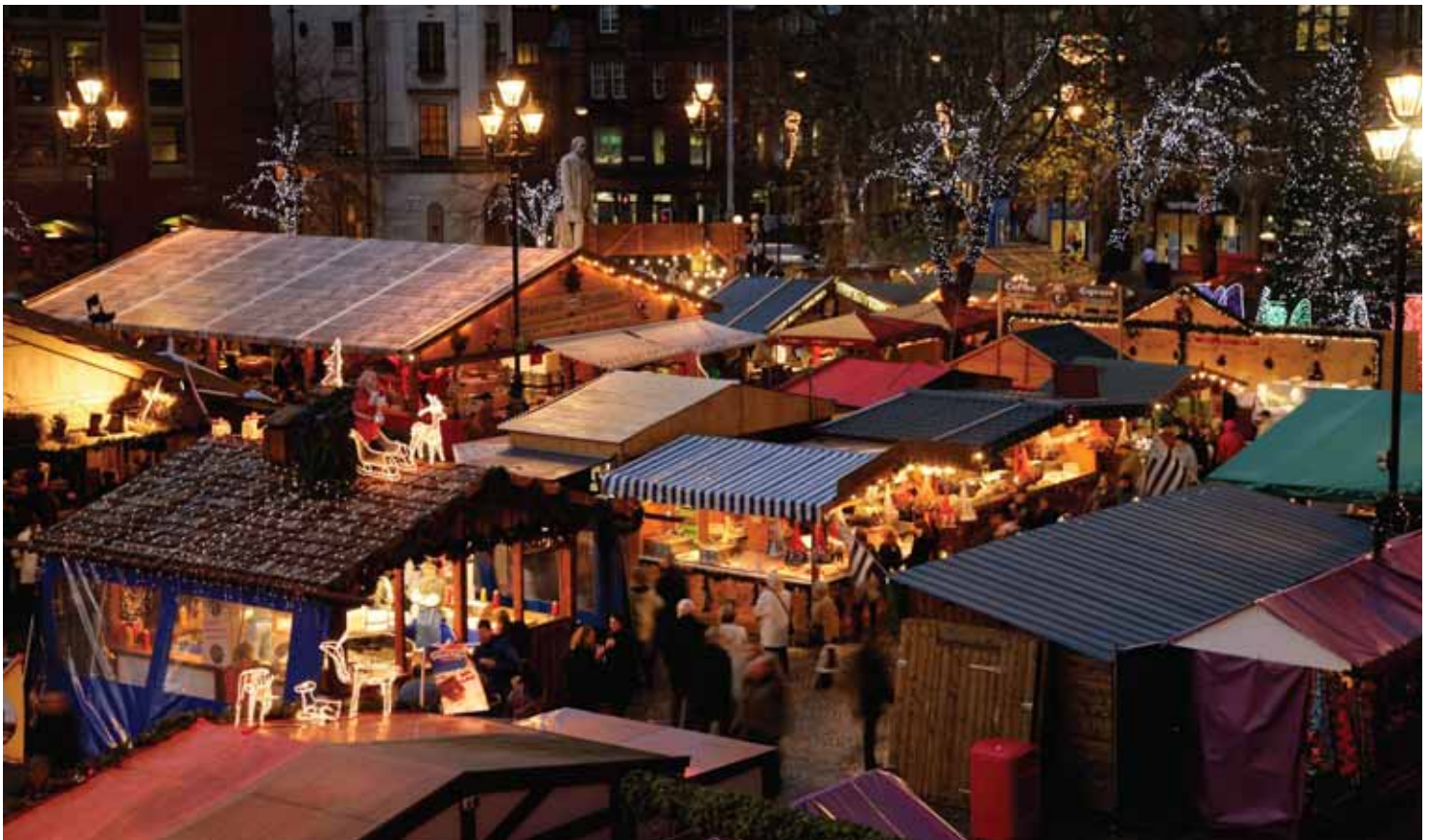
Manchester Christmas Markets

Manchester Christmas Markets Albert Square, St. Ann's Square, Exchange Square www.manchester.gov.uk/markets 18 Nov-21 Dec