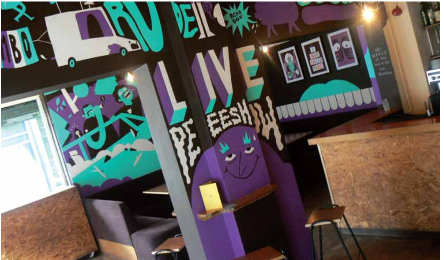
A Place Called Common

A Place Called Common Edge Street M4 1HW Telephone 0161 832 9245 www.aplacecalledcommon.co.uk